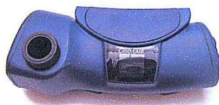
Clean-AIR Chemical 2F Plus TH3