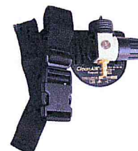
Clean-AIR Pressure 2A