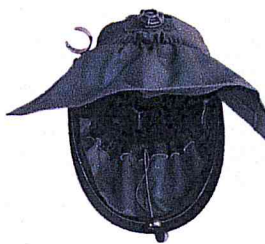
face seal long