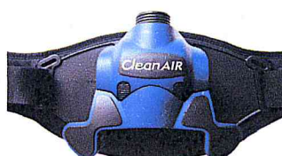
Clean-AIR Chemical 3F Plus TH3