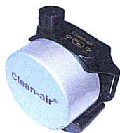
Clean-AIR Basic 2000 Dual Flow TH1