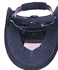
face seal flexi