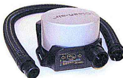
Clean-AIR Basic 2000 Flow Control TH3