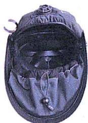
face seal standard