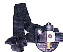
Clean-AIR Pressure Flow Control 2A

Welding hood CA-20 is compatible with turbo unit Clean-AIR Basic 2000 Dual Flow TH1 resp. Clean-AIR Basic 2000 Flow Control TH3 equipped with filters against particles; the set provides protection against harmful aerosols in accordance with the information supplied by the manufacturer.